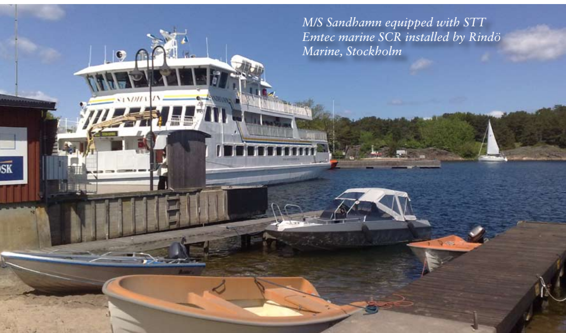
M/S Sandhamn equipped with STT Emtec marine SCR installed by Rindö Marine, Stockholm

The move into emissions control systems for the maritime sector is a natural progression from the automotive experience. It is obvious that the STT Emtec SCR technology will be a considerable contributor to the shipping industry's NOx reduction efforts.